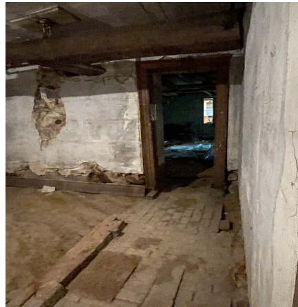
Note: Spadina House foundation with doorframe. Erica Frail (2023)