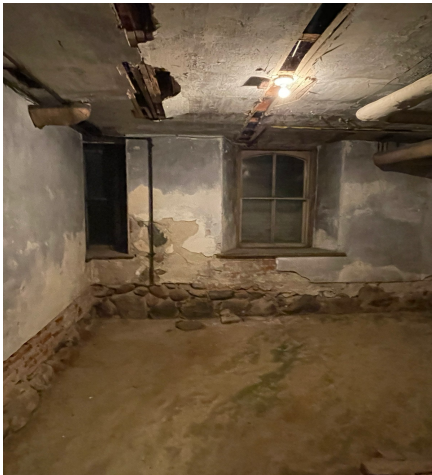
Note: Spadina House foundation with Window Erica Frail (2023)