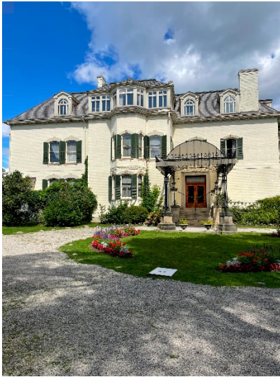
Note: Front of Spadina House. Erica Frail (2024).