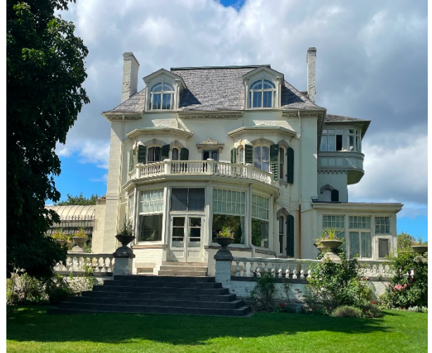
Note: East-side of Spadina House. Erica Frail (2024).